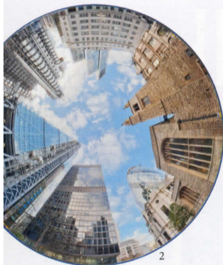
1 Top draw – Phyllida Barlow, Untitled , 2001, at Hauser & Wirth. 2 Looking up – Peter Newman, London St Mary's Axe , 2013, at Eleven. 3 Moment captured – Zanobi Strozzi, The Abduction of Helen , c1450-5, at the National Gallery.

IT'S DEGREE SHOW TIME at most art schools this month. Support your local college – ring them to check dates and times